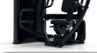
Heavy Duty Construction