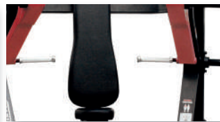
Black Comfortable Pad