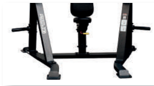
Heavy Duty Construction