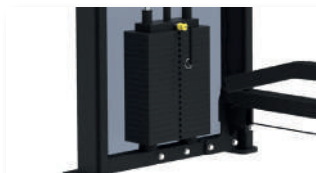
Easy Weight Selection