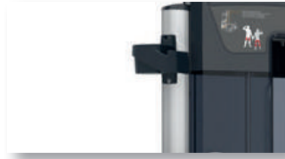
Water Bottle Holder

The Perform Series Lying Leg Curl isolates the hamstrings with optimal resistance through a single joint, knee flexion movement. The forearm and angled hip pads encourage proper spine alignment and minimise back stress, whilst the range limiting device lets users choose a comfortable starting position.