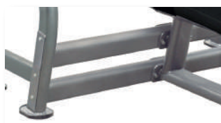
Strong Sturdy Frame