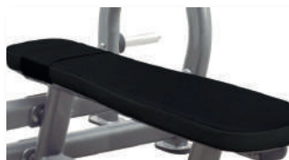
70mm Thick Pad