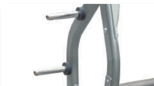
Olympic Plate Storage Pins