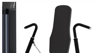
Dual Hand Grips