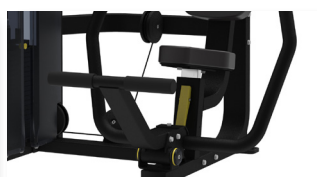
Assisted foot support