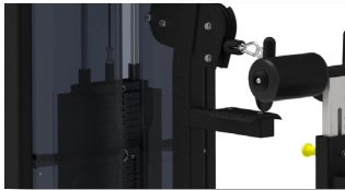
Easy Weight Selection