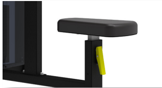
Adjustable Seat Pad

The specially designed Pro Series, Lateral Raise helps the user to strengthen deltoid. With an easy weight selection using a selector pin and an easily adjustable seat pad, this gives the user the utmost comfort and ease to train.