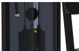
Easy Weight Selection