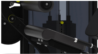
Easy Weight Selection