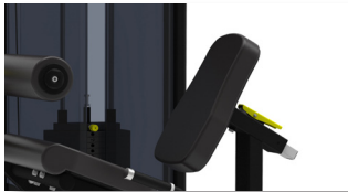
Adjustable Back Pad