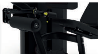
Black Moulded PU Foam