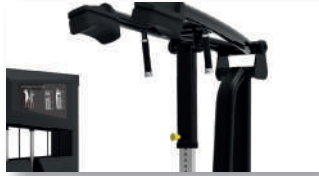
Adjustable Shoulder Pads

The Platinum Series Standing Calf machine allows to train gastrocnemius muscles. User can set up personal settings to effectively train calf muscles. With innovative features the exercisers can tailor the equipment experience to suit their need. While clean lines and subtly rounded tubing create an elegantly modern design and premium look, perfect for any fitness setup.