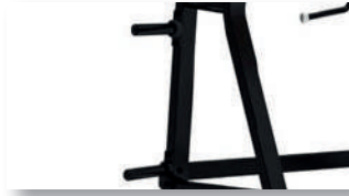
Weight Plate Pins