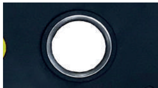
Stainless Steel Inner Ring