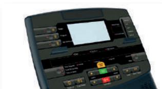
8 x 16 Dot-Matrix Display