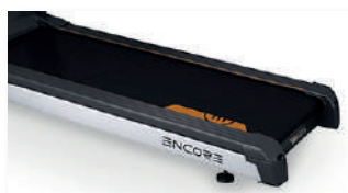
Low Step Up Height