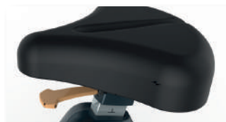
Easy Seat Adjustment