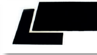
Corner Tiles Available