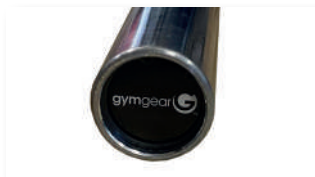
Integrated End Cap