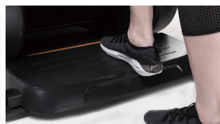
Easy to Step Onto