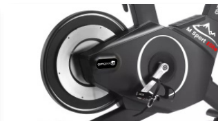
Rear Wheel Design