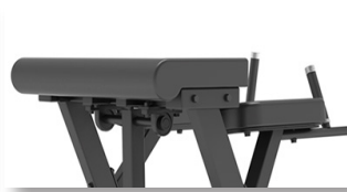
Large Pads for Comfort