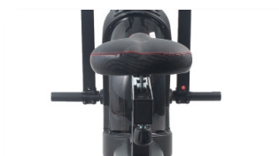
Foot Pegs for Upper Body Workout