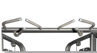
Chin Up Bar