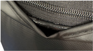
High Quality PU