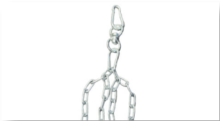
Chain and Swivel Included